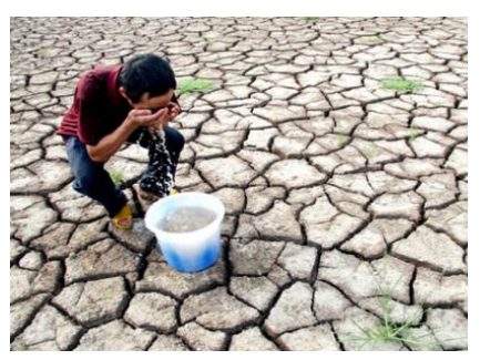
Above: For over five years, East Syria faces an extreme dryness endangering cutivated lands in East Syria and threatening food security.

Water resources are scarce in the Mediterranean Arab countries, making them vulnerable to desertification. Climate change is expected to worsen the situation. So, sharing information about resources is a key issue. A regional workshop about a regional water resource information system took place in Damascus, Syria, Dec. 20 & 21, 2010. EMWIS (Euro Mediteranean Water Information System) in cooperation wih Adasa Sistemas (Spain) presented the EU experience in that domain and the Spanish SIA example, recommending approaches to set up water resource information systems and guidelines for interoperability with the WISE European system. A special session was dedicated to designing and implementing Syrian water resource information systems.