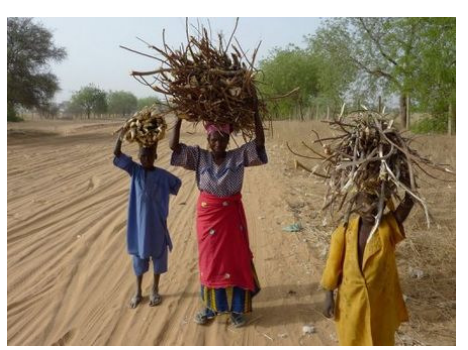
South Niger - A woman and her children walking to the Maradi market to sell wood (© 2009 AFP);

In spite of many international resolutions and some proactive policies, the fate of women in drylands is worsening or at best not improving. Such is the key outcome of the FAO report «Gender dimensions of agricultural and rural employment: Differentiated pathways out of poverty" (2010). The situation of women has always been critical in areas threatened by desertification, while they could bring unique solutions to reverse the phenomena at stake. The report underlines that women need access to education, training, credit, markets, technical assistance and labor protection. They also need equal, secure access to land and other assets. Last but not least, they need — and can bring - 'social capital', including the ability to participate equally with men in farmers' organizations, especially in areas endangered by soil degradation and subsequent hunger. It